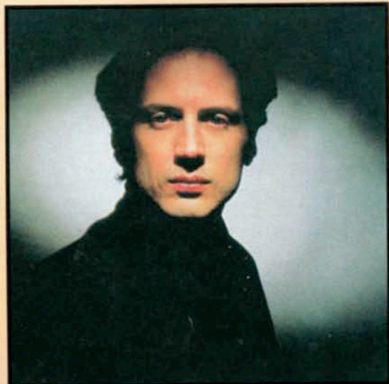
A SOURCE OF INSPIRATION, the ancient Greek spring CASTALIA lends its name to MARK ISHAM's new album, his first for Virgin Records. The renowned composer, producer and trumpeter has worked with the likes of Van Morrison, Suzanne Vega and David Sylvian, in addition to his film scores and enormously successful solo recordings. "THE GRAND PARADE" is among the featured tracks on MARK ISHAM's CASTALIA .