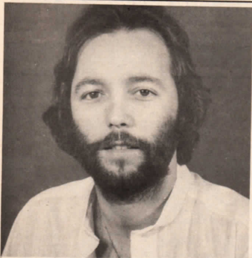
The bearded philosopher, Ruben Blades attacks the superficiality of disco in his tune "Plastico" from the visionary album SIEMBRA.

Obviously, that's the way Ruben wants to keep it. He isn't about to exchange a false illusion for genuine feeling, for feelings are what his songs are all about. "I think people have got to be brought out of themselves more, or encouraged to go into themselves more deeply... When I first got here, I was told that