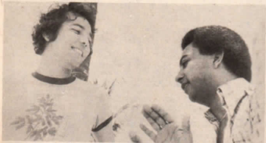
Panamanian Ruben Blades relaxes a moment with Puerto Rico's pianist Papo Lucca. Taken on location with the Fania All Stars in P.R.