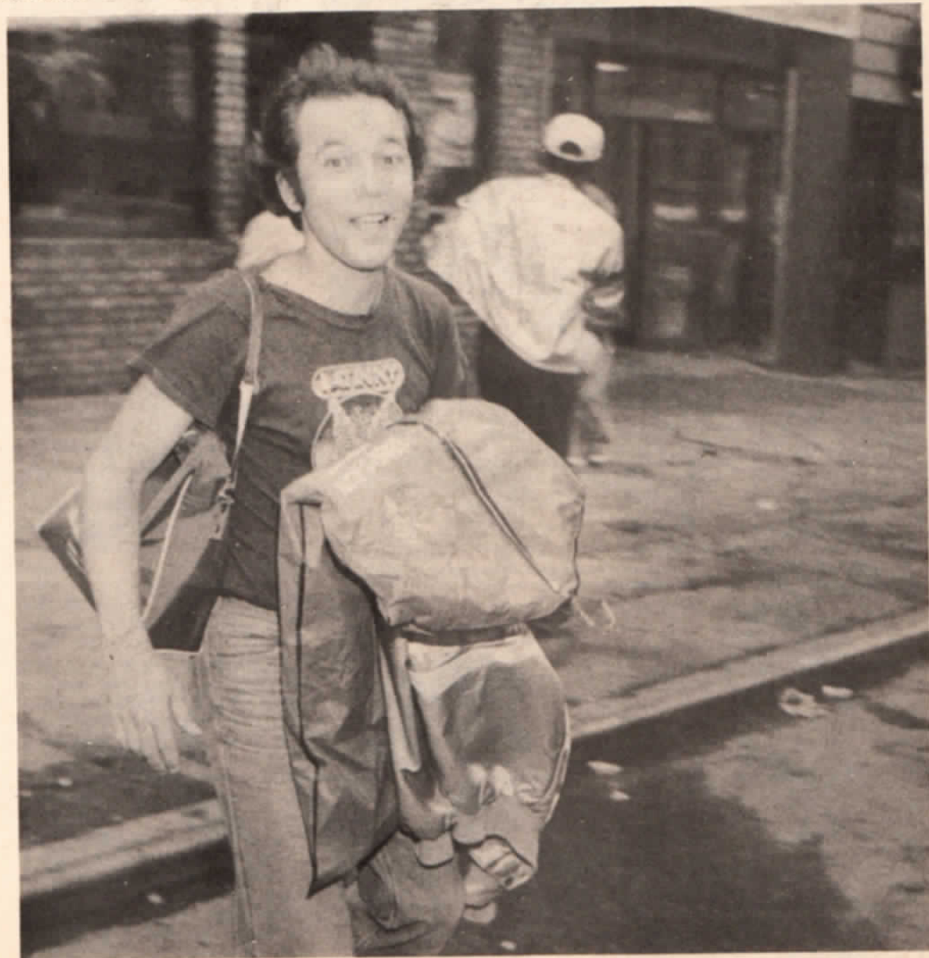
On the move—Ruben makes a fast getaway from the Corso to board a tour bus.

Ruben Blades stepped into our offices at Latin N.Y. right after putting the finishing touches on his latest recording