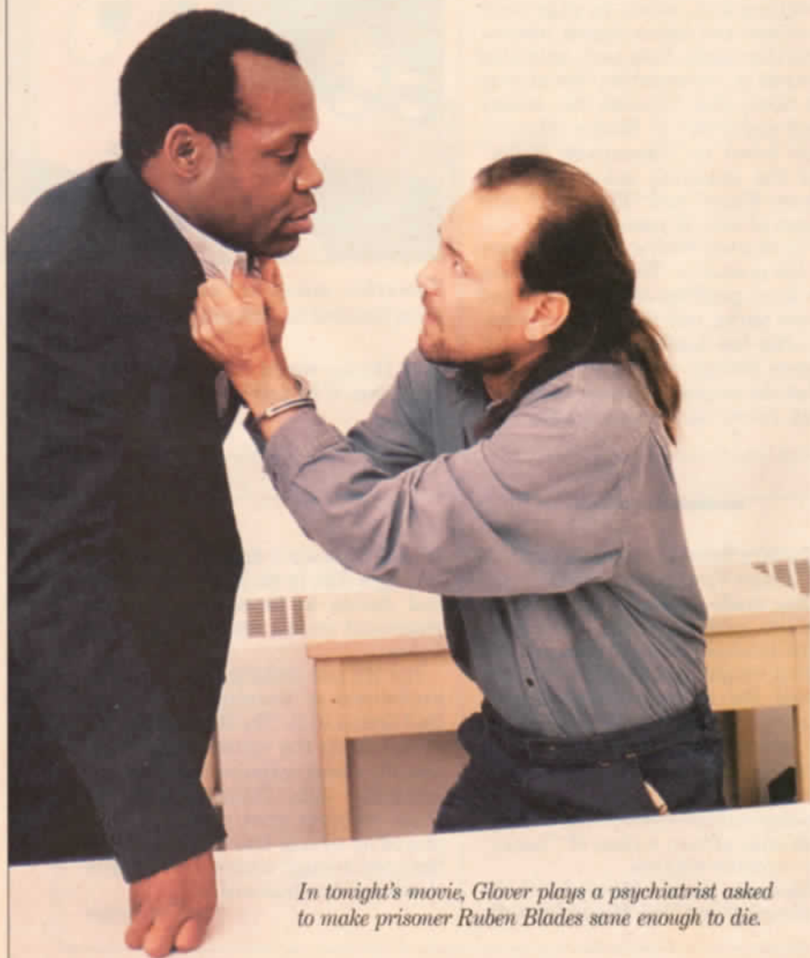
In tonight's movie, Glover plays a psychiatrist asked to make prisoner Ruben Blades sane enough to die.

"Dead Man Out" for the 90-minute HBO drama debuting tonight at 10. But whatever the cable network decided to call the story, its busy and increasingly acclaimed co-star Danny Glover would have found filming it an unsettling personal experience.